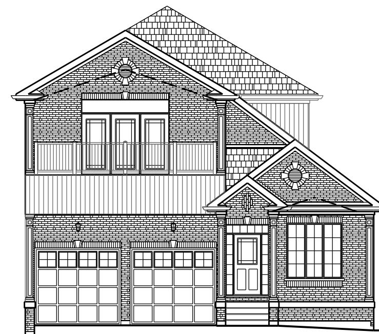
Front ( North ) Elevation