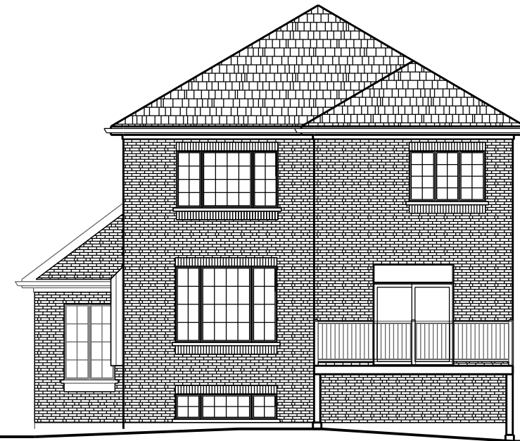
Rear ( South ) Elevation